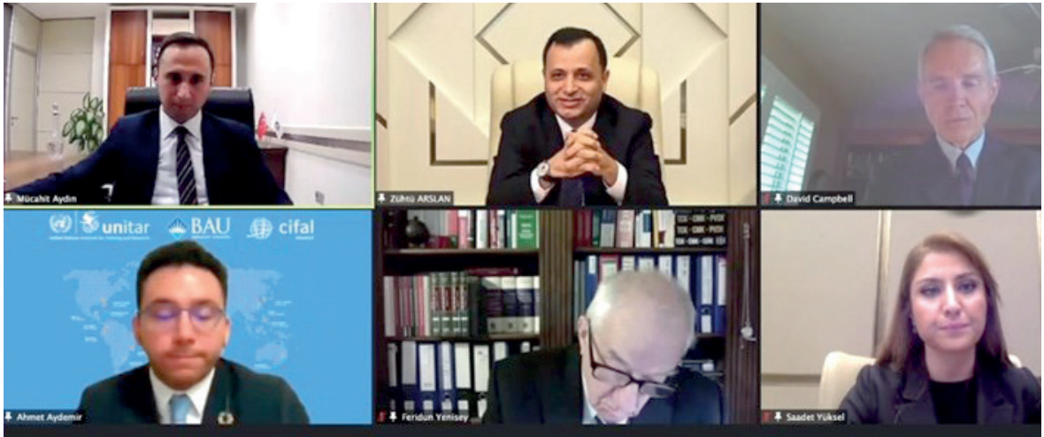
Online Program on “Reflections on Human Rights”