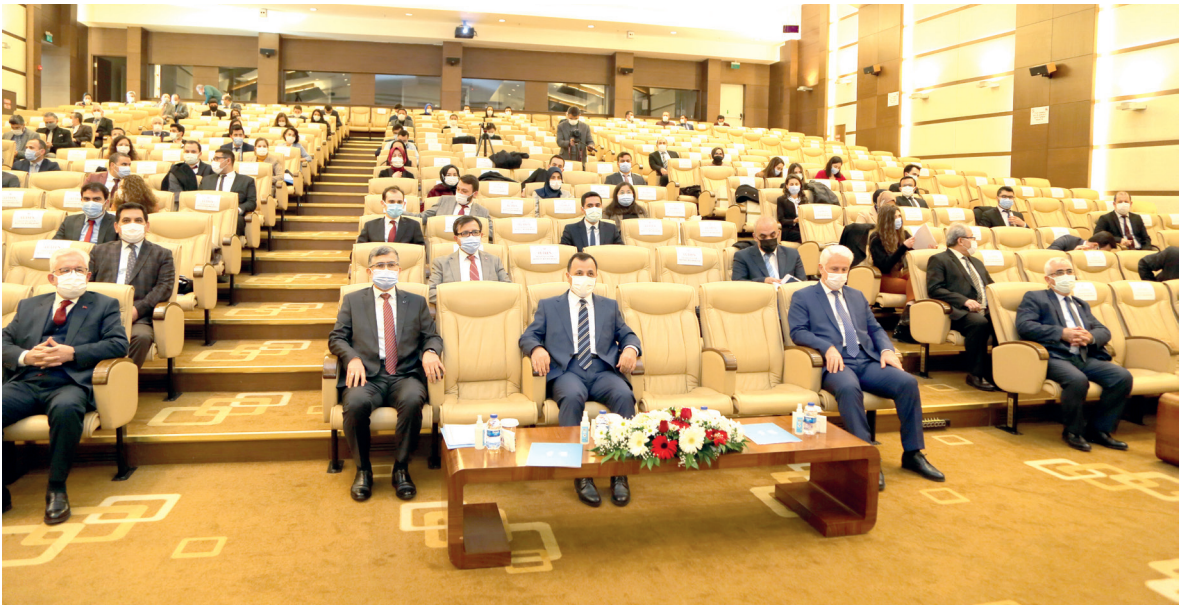
Training seminar for the Assistant Specialists of the Human Rights and Equality Institution of Turkey