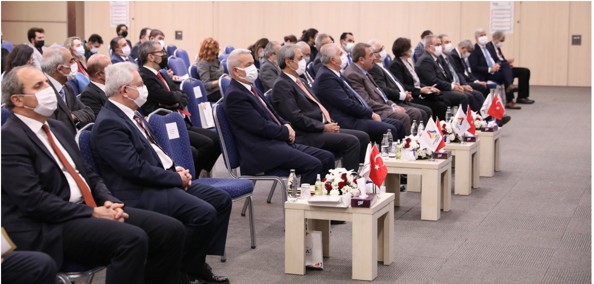
Symposium on “Repercussions of Individual Application Judgments on Private Law”