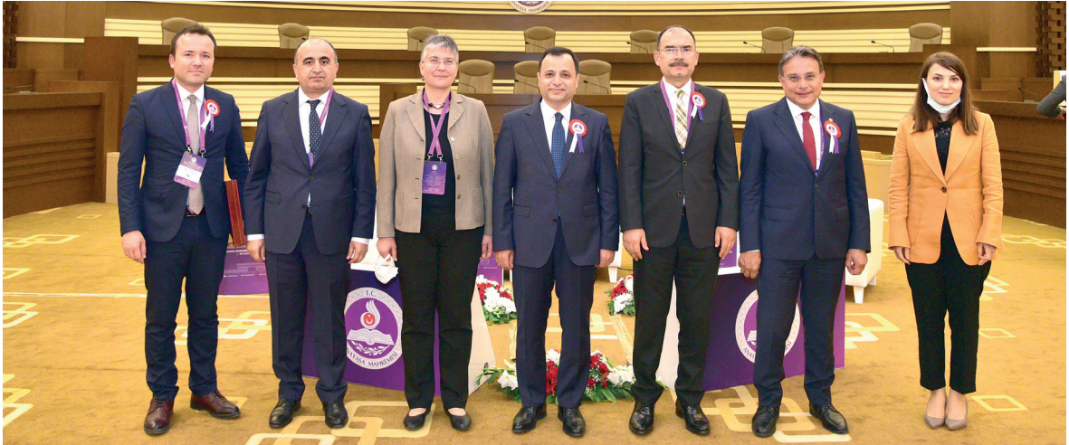
President Mr. Zühtü Arslan, meeting with those delivering presentations during the symposium

Among those who attended the symposium, which was held on 28 June 2021 at the Grand Hall Tribunal of the Constitutional Court, were President of the Constitutional Court Mr. Zühtü Arslan, President of the Court of Cassation Mr. Mehmet Akarca, President of the Council of State Mr. Zeki Yiğit, Minister of Justice Mr. Abdülhamit Gül, justices of the Constitutional Court, officials from higher judicial bodies, academics and jurists.